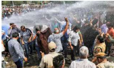
Police use water cannons in Jaipur to disperse doctors protesting against Rajasthan's Right to Health Bill which was passed by the Assembly on Tuesday.

The Bill, which was tabled in the Assembly on September 22 last year and was later referred to a Select Committee, was passed by voice vote in the House. The Bill gives every resident of the State the right to emergency treatment care "without prepayment of requisite fee or charges" by any public health institution, health