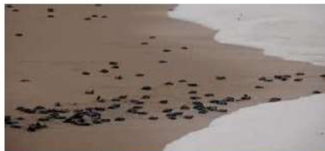
Highest congregation: Rushikulya is estimated to have hosted 6.37 lakh turtles from February 23 to March 3

This year, the Rushikulya beach has hosted around 6.37 lakh turtles – highest ever congregation – from February 23 to March 3. After 50 days, baby turtles have emerged from eggs themselves and started their journey towards sea. "This year, mass nesting and hatching have been smooth. There was no adverse weather condition that could have hampered the processes. On part of the forest department, we have provid-