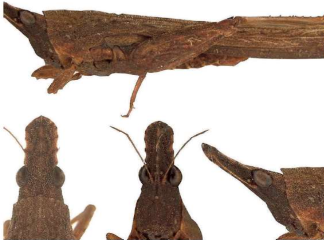
The specimen of Dravidacris annamalaica, which researchers collected from Annamalai Nagar in the State.

A paper on the new addition to the grasshopper