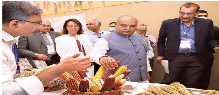
Narendra Singh Tomar at the inauguration of the 9th session of governing body of ITPGRFA in New Delhi on Monday.

“All international forums must not forget that food is an essential fundamental right. Developing countries will be motivated by the need to ensure that the rights of farmers producing food are never compromised,” he said adding that the struggle for climate resilient agriculture and nutritional security