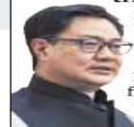
KIREN RIJJU Union Law Minister, at a function on October 18

October 2015 had thwarted the "will of the people" by striking down the 99th Constitution Amendment Act, which introduced the NJAC mechanism.