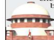
SUPREME COURT in a November 11 judgment

2015 judgment should be rendered void ab initio as it had revived the Collegium system.