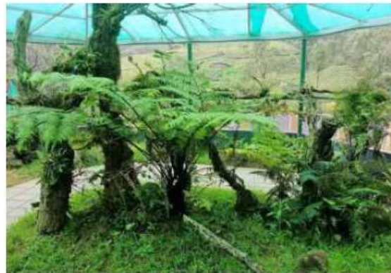
Pioneer attempt: The Eravikulam National Park in Munnar has set up a fernarium inside the park.