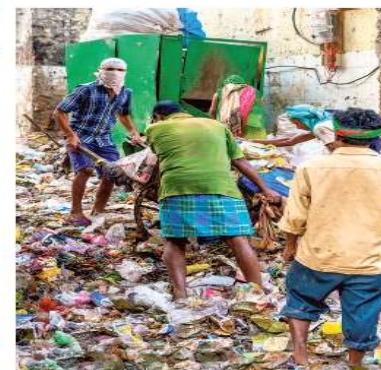
issuing of guidelines.

Now the challenge is to see how the local level authorities will enforce the ban in accordance with the guidelines. Banned items such as earbuds with plastic sticks, plastic sticks for balloons, etc., are non-branded items and it is difficult to find out who the manufacturer is and who is accountable for selling because these items will be available in the market even after the